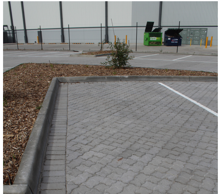
L shaped ELPAVE WITH HEADERS at the edge.